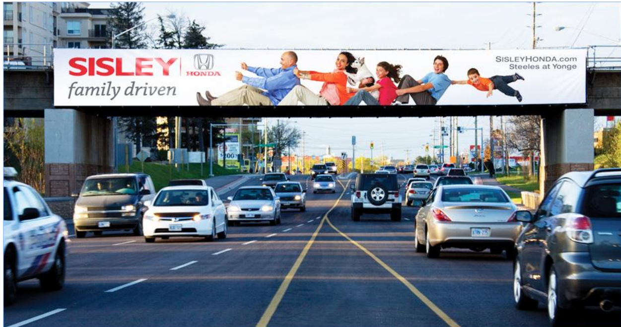
(Ad space on a Vaughan overpass)